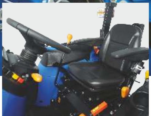
SIDE SHIFT LEVER