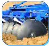
HIGH QUALITY BORON STEEL DISC