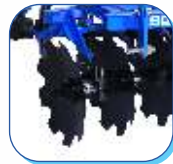
USED FOR CHOPPING UP UNWANTED WEEDS OR CROP RESIDUE