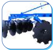
COMBINATION OF PLAIN & NOTCHED BORON STEEL DISC