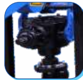
HEAVY DUTY GEARBOX