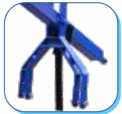
HEAVY DUTY TABULAR FRAME FOR TOUGH OPERATIONS