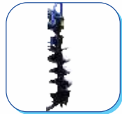
AVAILABLE OPTION IN AUGER SIZE 9", 12" & 18"