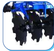
USED FOR CHOPPING UP UNWANTED WEEDS OR CROP RESIDUE