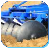
HIGH QUALITY BORON STEEL DISC