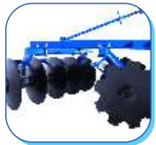
COMBINATION OF PLAIN & NOTCHED BORON STEEL DISC