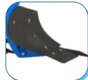
LONG LASTING HEAVY DUTY BLADE & BAR POINT