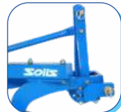
HEAVY DUTY 3 POINT LINKAGE