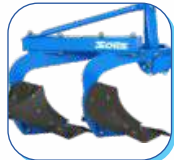
HEAVY DUTY FURROW